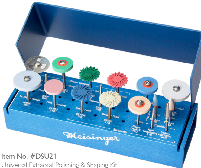
Item No. #DSU21 Universal Extraoral Polishing & Shaping Kit according to Dentsply Sirona®