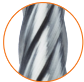
close-up of the unique helical fluting